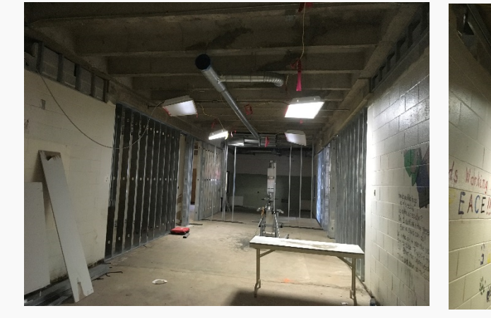
Interior MEP Rough and framing at renovation