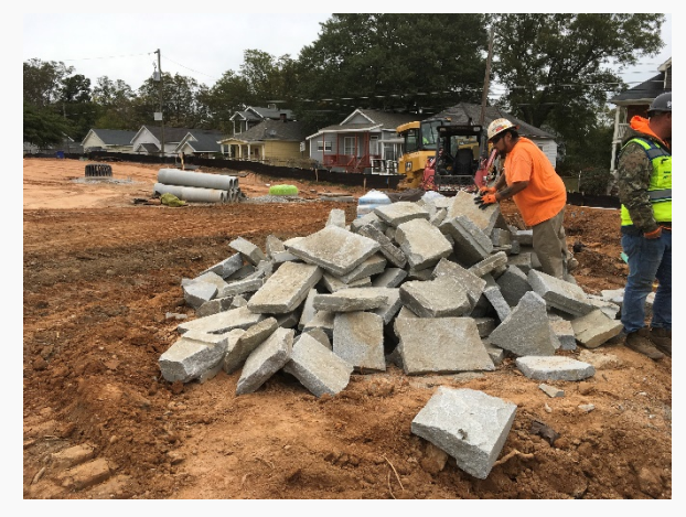
Extension of rubble wall at Mary St